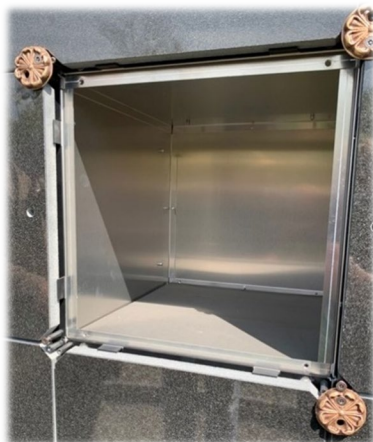
small niche interior

Small Potted plants are only permitted in an approved pot or cemetery urn and must fit on the base of the headstone in the Cremation Garden. For safety reasons, glass, ceramic or other breakable items are not permitted. Flimsy Plastic pots are strongly prohibited as they do not withstand wind, storms and weed-eating. Funeral flowers should be removed from the cemetery by the family the same day as burial or interment.